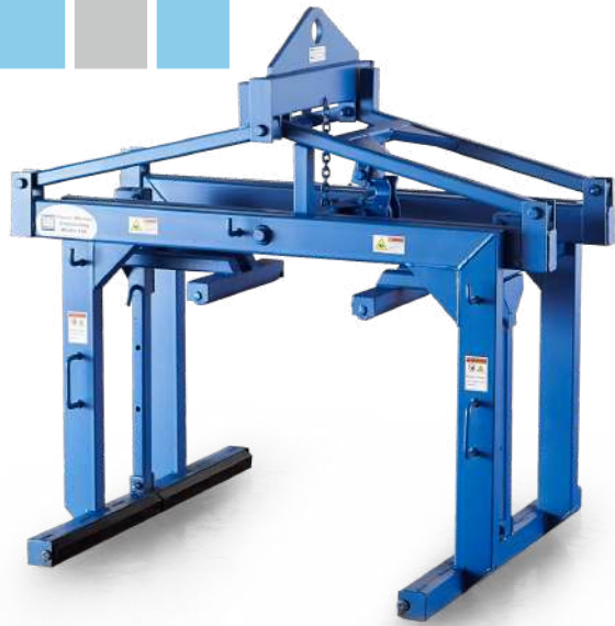
Images are for illustration purposes only and may be subject to change