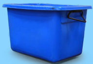
Plastic Mortar Tubs